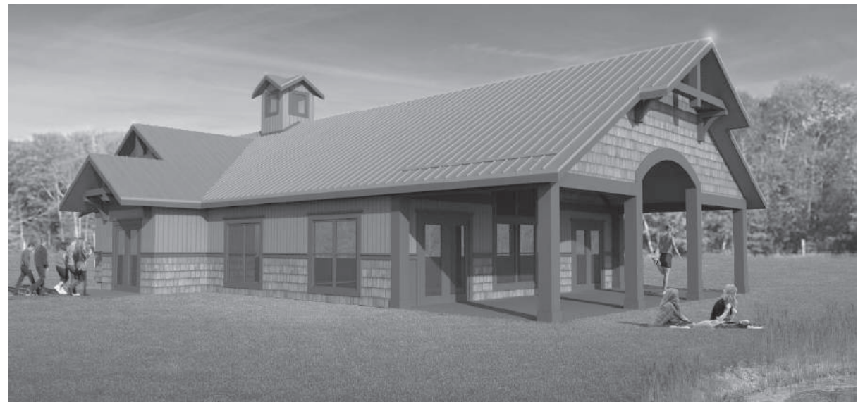
Sweden Town Park Lodge. With help from the Sweden Community Foundation, the Town of Sweden has secured a $446,145 grant from NYS for construction of a lodge, additional playground equipment and a sidewalk from the town park on Redman Road to the Canal. Thank you Sweden Community Foundation for all you do to improve recreation and the quality of life in the greater-Sweden community!