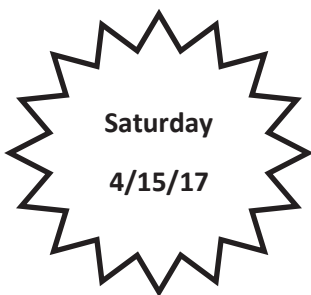
Table Rental- $5